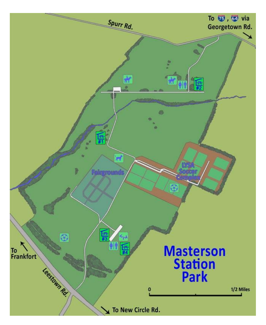
LGRA and Lure Coursing near Shelter #1 (Shelter #1 is left-center of the map) To the right of the Dog Park In the large open area